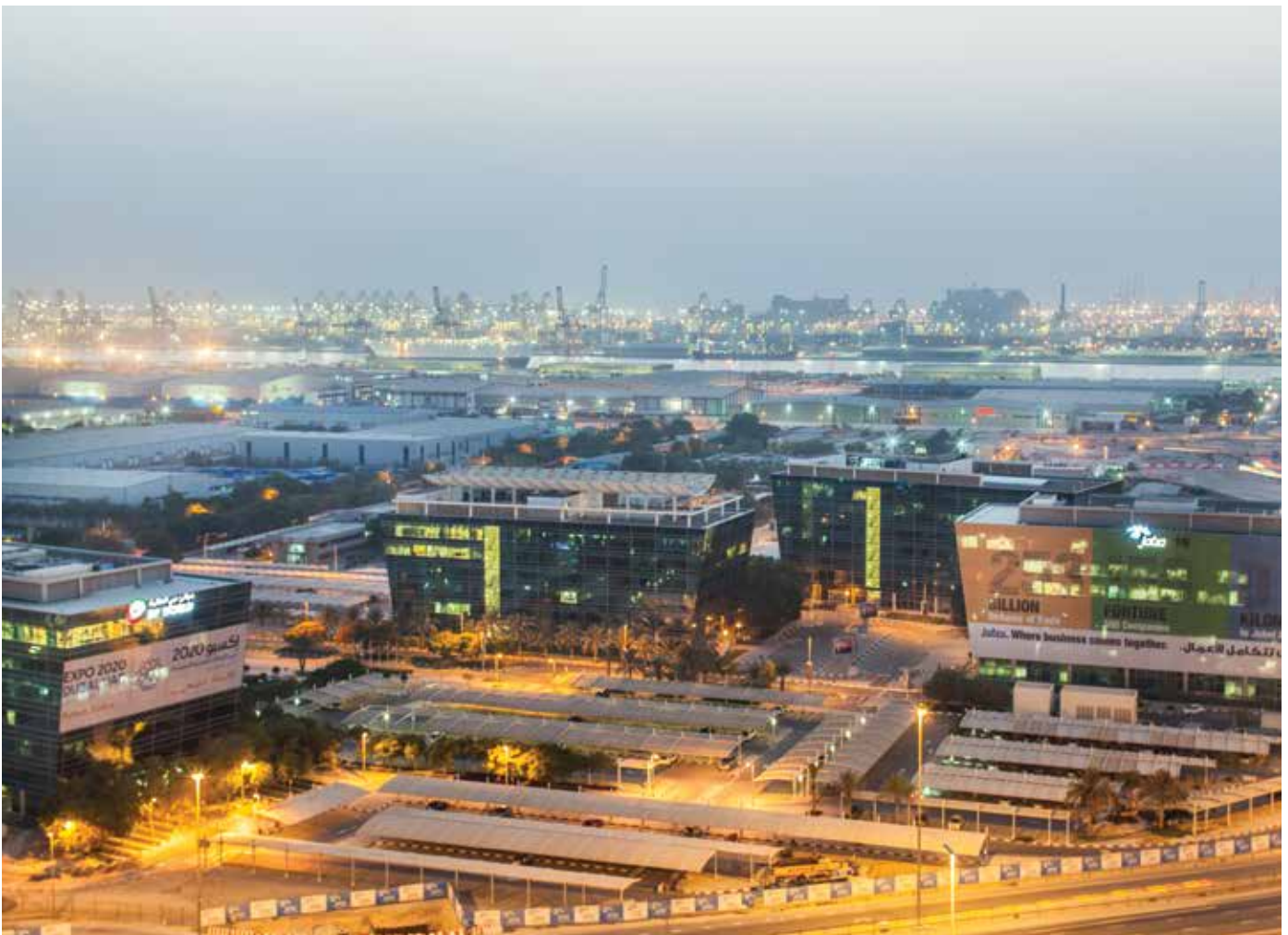
Jebel Ali Free Zone and Jebel Ali Port

By forging strong, lasting relationships – with customers, governments, stakeholders and the communities where we operate – we are building a sustainable future to support our vision to lead the future of world trade.